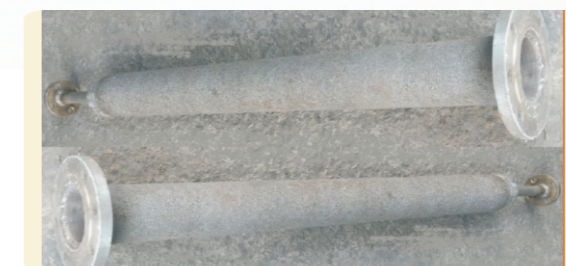
AMMONIA CRACKER RETORT