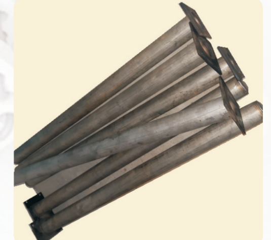
ALLOY RADIANT TUBES