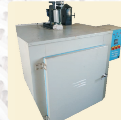
DRYER FOR PHARMA