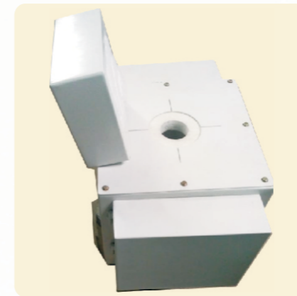
GOLD MELTING FURNACE