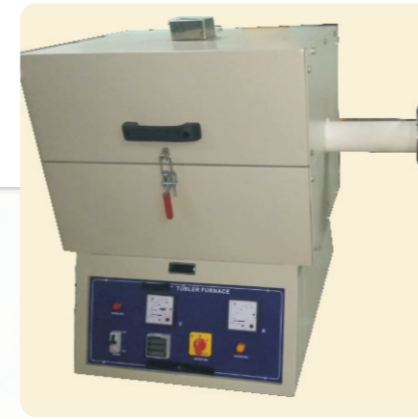
INSTITUTIONAL FURNACE FOR R&D